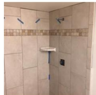
File Description Shower Floor